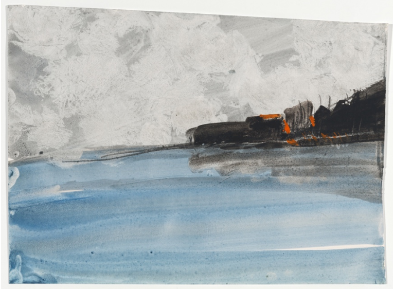
A watercolor landscape from Parker's summer 2014 trip to the Midwest

Phillips/Schumacher: What was your trip west for?