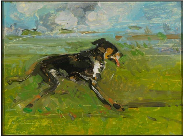
A landscape from memory with dog running from summer 2014.